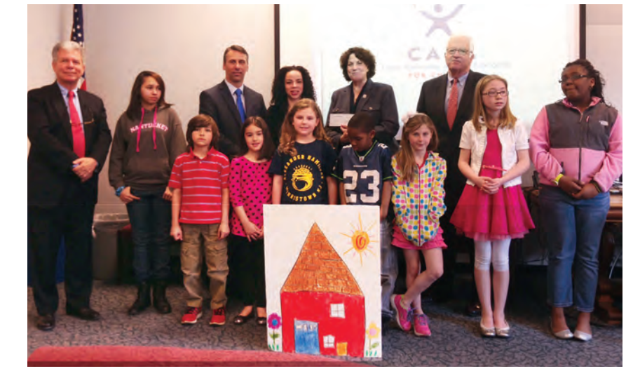
Students and Faculty representing the Morris School District

CASA of Morris and Sussex Counties was the top vote-getter in the Morris School District's 2014 Coins for a Cause charity fundraiser. As the winning charity, CASA was awarded $12,000, from students' coin collections and an additional $1,000 which was contributed by Provident Bank, Coins for a Cause partner.